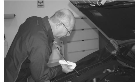
One Stop For All Your Service Needs

Your Nissan dealer is a full-service maintenance and repair center. We recommend using authorized Nissan Service and Genuine Nissan Parts that we have designed for their reliability, safety and suitability for your Nissan vehicle. We are committed to providing you with quick, efficient and competitively priced service and parts.